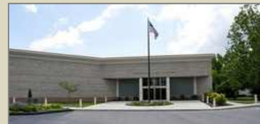
Community members founded the Museum in 1928. Today, it offers 13 galleries and nearly 10,000 original works of art. Admission is always free.

Have a special interest, experience or talent? FOSAM wants to know how you'd like to help art in our region.